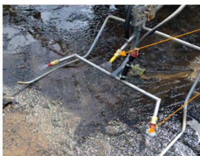
Centre air induction Nozzle Wing nozzles

The Dual Herbicide Sprayer replaces the spray bar of the common Irvin legs setup. Glyphosate is applied to the inter-row through a centre Air Induction nozzle while applying more conventional herbicides such as Paraquat, Diuron, 2,4-D into the row itself through 'wing nozzles'.