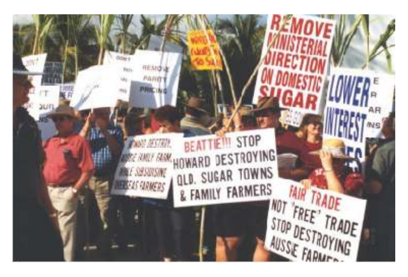
addressed\ at\ the\ recent\ round\ of\ trade\ negotiations\ in\ Geneva.\ It\ is\ hoped\ that\ the\ agreement\ to\ cut\ domestic\ support\ will\ weed\ out\ inefficient\ producers\ and\ improve\ Australia's\ market\ access.